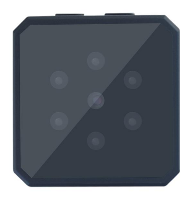
WIFI Camera Manual V33.0